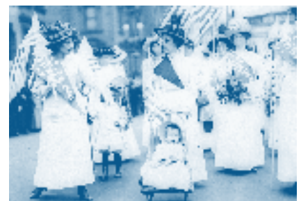
Suffragette parade in New York City in 1912

The 19 th Amendment gave women the ability to vote. It was a result of decades of hard work by the women’s rights movement. This was also known as the women’s suffrage movement. The 15 th