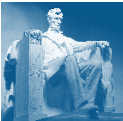
The Lincoln Memorial in Washington, DC

northern states. Lincoln was a lawyer, legislator, and celebrated speaker before he was President. He became nationally famous for his debates with Senator Stephen A.