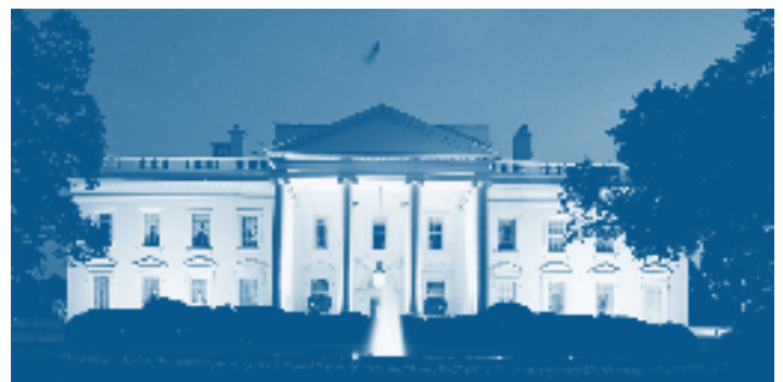
The White House in Washington, DC

The White House was built between 1792 and 1800. President George Washington helped choose its exact location and supervised its construction, but never actually lived there. America’s second President, John Adams, was the