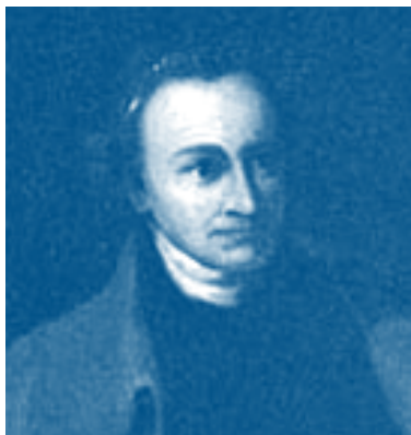
American patriot Patrick Henry

Patrick Henry was a fiery leader of the American Revolution. Before U.S. independence, he spoke out for colonial rights within the Virginia legislature. Henry represented Virginia in both the First and Second Continental Congresses. He helped push the colonies toward independence. In 1775, when the Revolutionary War began, Henry convinced Virginia to join the colonists’ side. Later he became the first governor of Virginia.