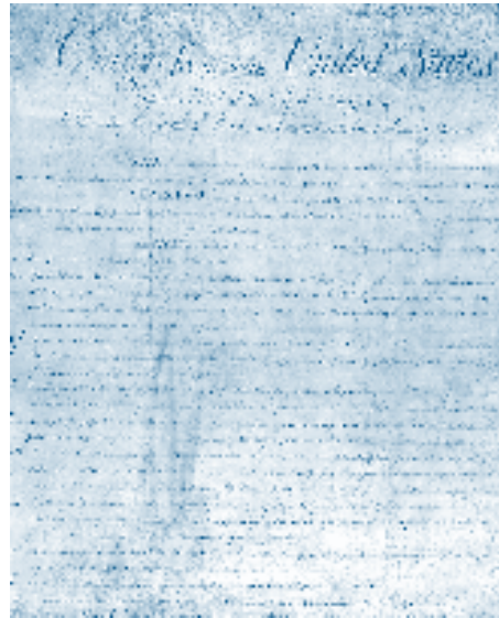
The Bill of Rights

When the Constitution was first written, it did not focus on individual rights. Its goal was to create the system and structure of government. Many Americans, including a group called the Anti-Federalists, wanted a specific list of things the government could not do.