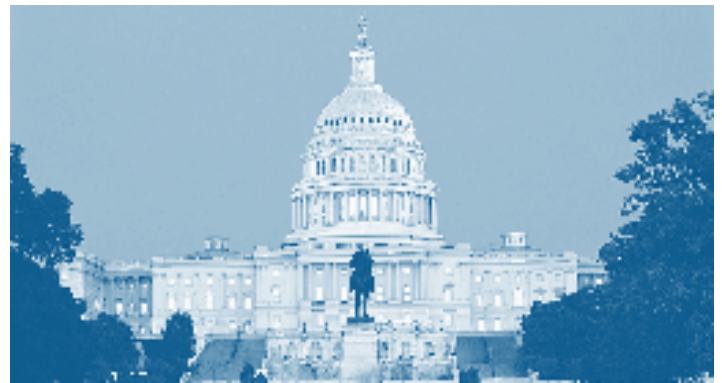
The Capitol in Washington, DC, where Congress meets to make federal laws

The main job of Congress is to make federal laws. Congress is divided into two parts—the Senate and the House of Representatives. By dividing Congress into two parts, the Constitution put the checks and balances idea to work within the legislative branch. Each part of Congress makes sure that the other does not become too powerful. These two "check" each other because both must agree for a law to be made. A Congress divided into two parts is known as a bicameral legislature.