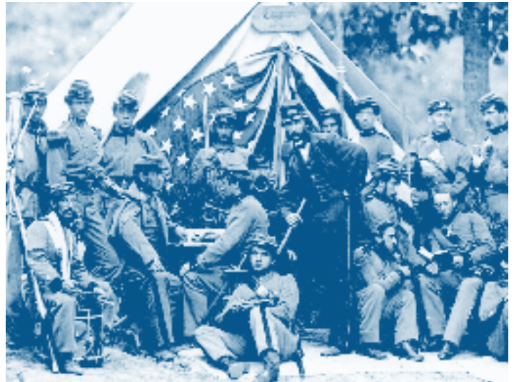
Civil War Engineers in the Union Army

Douglas. These took place when Lincoln and Douglas ran against each other for Illinois' U.S. Senate seat in 1858.