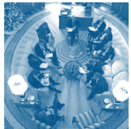
A meeting with the President in the Oval Office

The Constitution says that the leaders of the executive departments should advise the President. These department leaders, most of them called Secretaries, make up the Cabinet. Throughout history, Presidents have been able to change who makes up the Cabinet. For instance, when Congress created the Department of Homeland Security, President George W. Bush added the leader of this department to his Cabinet.