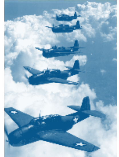
World War II airplanes

The United States officially went to war on December 8, 1941. President Franklin Roosevelt, as Commander-in-Chief of the military, obtained an official declaration of war from Congress. This was one day after Japan bombed Pearl Harbor, an American naval base in Hawaii. Japan’s partners in the Axis, Italy and Germany, then declared war on the United States, Great Britain, and their Allies. The Allies fought against the German Nazis, the Italian Fascists, and Japan’s military empire. This was very difficult for the United States, which had to fight wars in both the Pacific region and Europe.