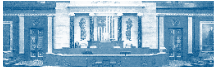
The U.S. House of Representatives in Washington, DC

The House has had 435 members since 1912. Since that year, however, the distribution among the states of those 435 members has changed. This is because the number of Representatives from each state is re-calculated every ten years. New information from the Census is used in this re-calculation. If one state gains many residents while another state loses many, the first state could get one or more new Representatives, while the other state could lose one or more. But the overall number of U.S. Representatives does not change.