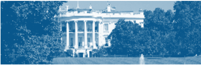
The President's home, the White House

this, they limited the powers of the head of the new U.S. government. They decided that the President would have to be elected by the people every four years.