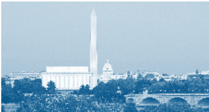
A view of Washington, DC, from Virginia, across the Potomac River. The view shows the Lincoln Memorial, the Washington Monument, and the Capitol.

When the Constitution established our nation in 1789, the city of Washington did not exist. At that time, the capital was New York City. Congress soon began discussing the location of a permanent capital city. Within Congress, representatives of northern states fought bitterly against representatives of southern states. Each side wanted the capital to be in their region. Finally, with the Compromise of 1790, the north agreed to let the capital be in the south. In return, the north was relieved of some of the debt that they owed from the Revolutionary War.