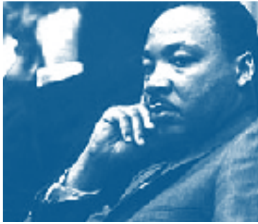
The civil rights leader Martin Luther King, Jr.

of the civil rights movement of the 1950s and 1960s. Because of this movement, civil rights laws that protected voting rights and ended segregation were passed. King believed in the ideals of the Declaration of Independence. He advanced the idea that every citizen deserves America's promise of equality and justice.