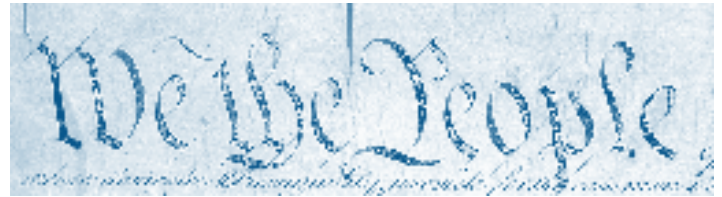
The Preamble of the Constitution

The preamble says: “ We the People of the United States, in Order to form a more perfect Union, establish Justice, insure domestic Tranquility, provide for the common defense, promote the general Welfare, and secure the Blessings of Liberty to ourselves and our Posterity, do ordain and establish this Constitution for the United States of America.” This means that our government has been set up by the people, so that it can be responsive to them and protect their rights. All power to govern comes from the people, who are the highest power. This idea is known as popular sovereignty.