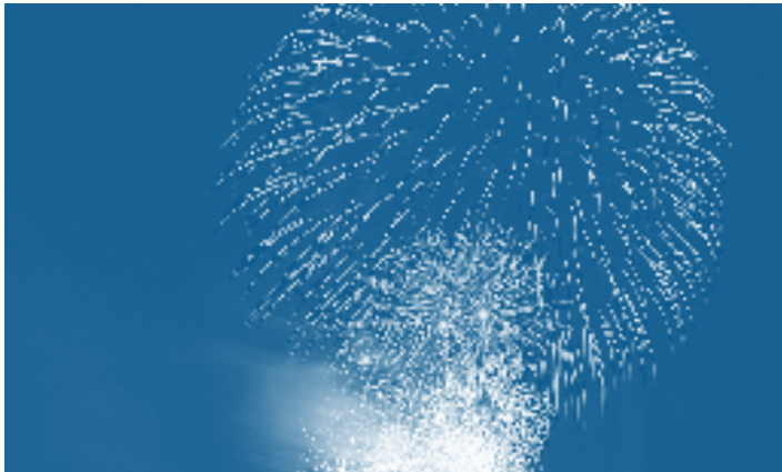
Fireworks on the 4th of July

The decision to break from the British was not an easy choice for many colonists. However, Great Britain’s “repeated injuries” against the Americans, as noted in the Declaration of Independence, convinced many to join the rebellion. After years of difficult fighting, the colonists went on to win their freedom.