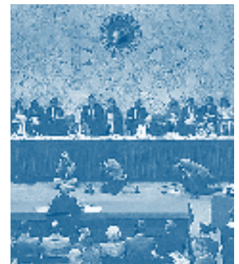
A session of the Senate

Several states, such as California, have term limits for members of their state legislature. Also, several states have considered limiting the number of terms that their U.S. Senators and Representatives can serve. In 1995, the U.S. Supreme Court ruled that no state can do this. The Court stated that such a practice would weaken the national character of Congress. The only way that Congressional terms could be limited is through an Amendment to the U.S. Constitution.