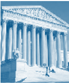
The Supreme Court

The U.S. Supreme Court makes sure that laws are consistent with the Constitution. If they are not, the Court can declare them unconstitutional and therefore not valid. In this case, the laws are rejected. The Court has the last word on all cases that have to do with federal laws and treaties. It also rules on other cases, such as those between states.